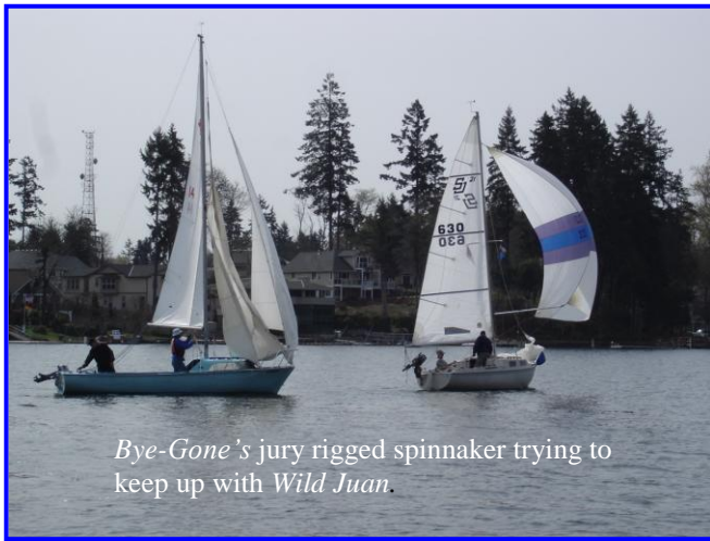
Bye-Gone's jury rigged spinnaker trying to keep up with Wild Juan.