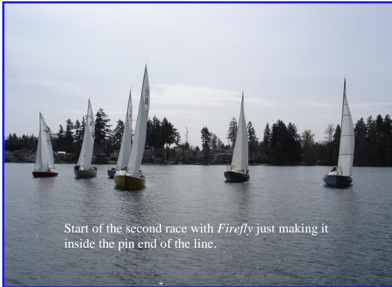
Start of the second race with Firefly just making it inside the pin end of the line.